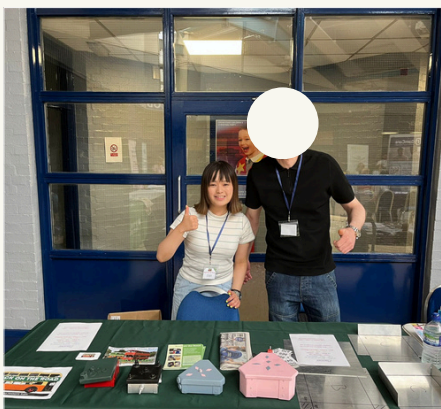
South Community Recovery Network ROSC event

BotR also delivered a presentation at the Scottish Recovery Consortium LERO meeting, led by two graduates. The presentation covered the programme's introduction, demonstrations, and a workshop overview.