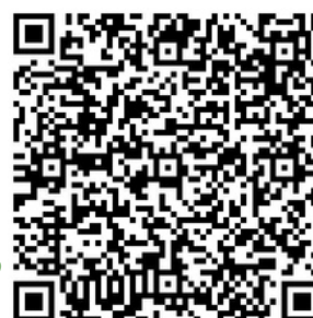
SCAN ME FOR THE LATEST ANNUAL REPORT