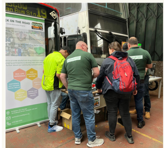
Glasgow Vintage Vehicle Trust Family and Community Day 2025